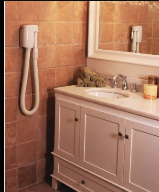
Easily remove hair and make-up powder from bathroom counter tops.