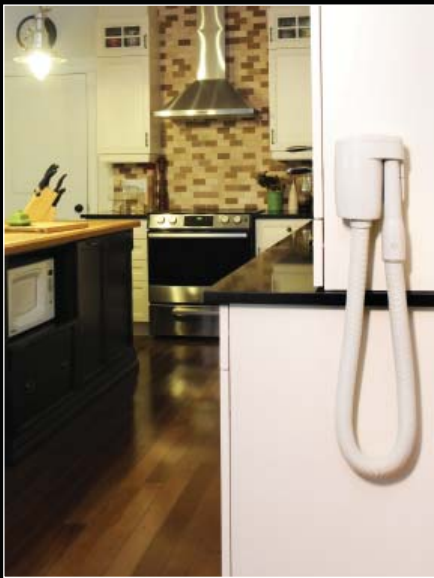
Ideal for cleaning dry messes in the kitchen.

Easy to use and practical, the Wally Flex is there when you need it.