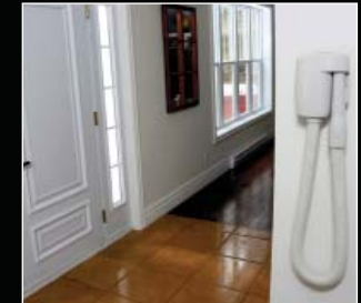
Keep a foyer or hall dirt free.

The Wally Flex is easy to install on to any standard central vacuum inlet. Simply fix the back plate on to the standard inlet mounting plate, then attach the Wally Flex console on to the back plate. Easy.