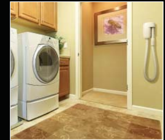
Perfect to quickly clean the dryer lint filter.